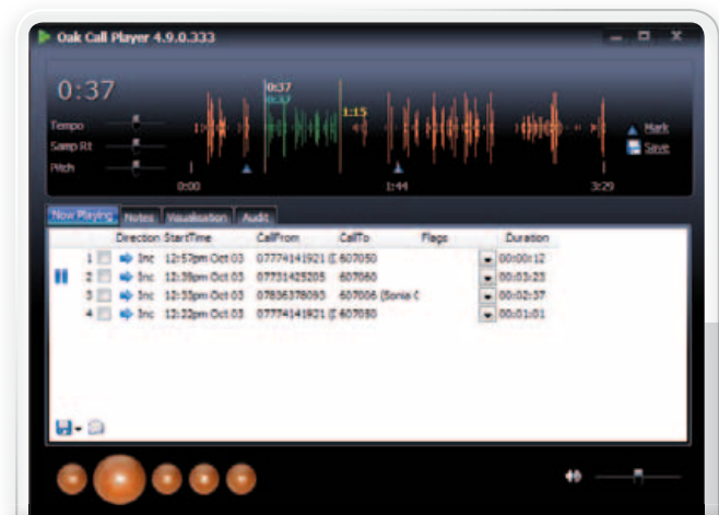
Play - Review calls visually within Oak's media style call player.