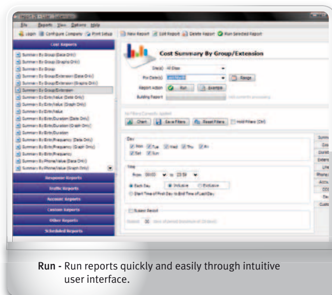
Run - Run reports quickly and easily through intuitive user interface.